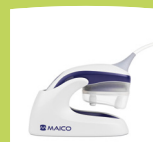
BERAphone® with cradle